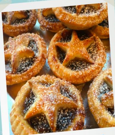
STAR OF WONDER MINCE PIES