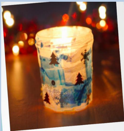
JAM JAR LANTERNS