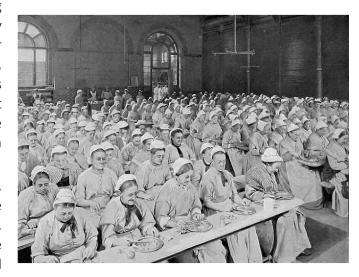
Women's mealtime at St Pancras Workhouse 1897

hospitals or wards of larger institutions. Some workhouses functioned as care and residential homes for a number of years. The days of the workhouse and the stigma and punishment that went along with being poor were over.