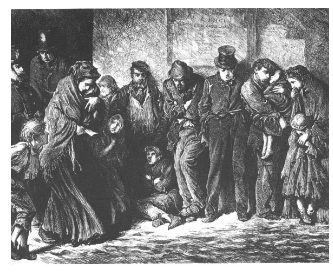
Houseless and Hungry by Samuel Luke Fildes

In 1869, the new weekly newspaper The Graphic took to the stands. The newspaper was aimed at the middle classes who would generally read the Illustrated London News which had been founded in 1841. The new weekly paper wanted to show the wealthy of London what life was like for the other members of English society and it was bent on social reform.