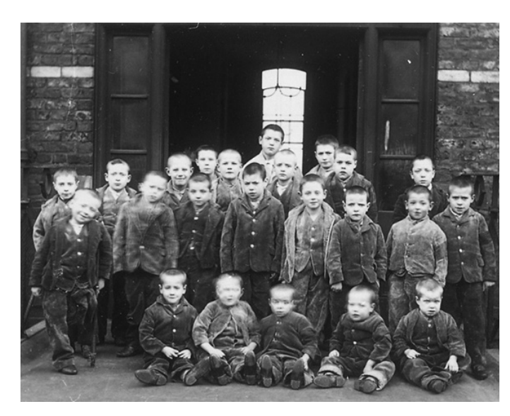
Children at Crumpsall Workhouse circa 1895

Picking oakum entailed taking lengths of old, tarred rope and unpicking the pieces. It was hard on the fingers and often performed by women or child inmates. In many workhouses, these tasks were to take place in silence.